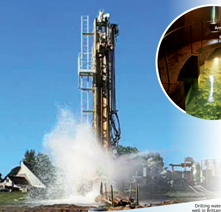
Drilling water well in Brittany