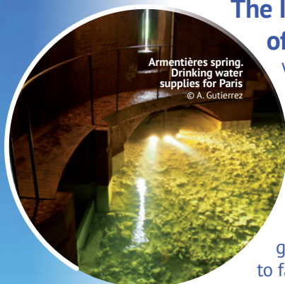
Armentières spring. Drinking water supplies for Paris