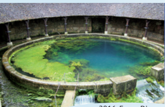
2016, Fosse Dionne in Tonnerre (Yonne)

2016 - 43 rd IAH International Congress "Groundwater and society: 60 years of IAH" (Montpellier)