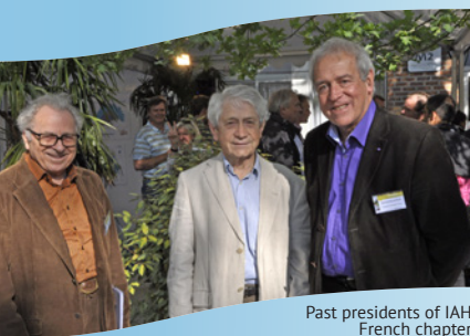
Past presidents of IAH French chapter