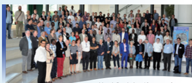
Hard-Rock Aquifers conference, June 2015, La Roche s/yon (Vendée)

2010 - The WFD after 10 years: dynamics for understanding and managing groundwater. Technical and scientific progress (Toulouse)